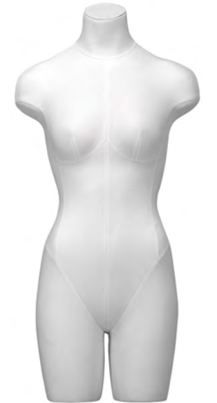
GFWA-16 available with bra size 75B / 34B or 80C / 36C