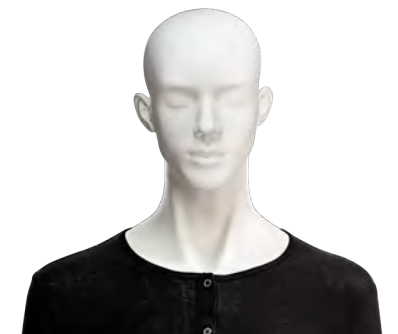
Head Yves-130001 only suitable for JULES mannequins