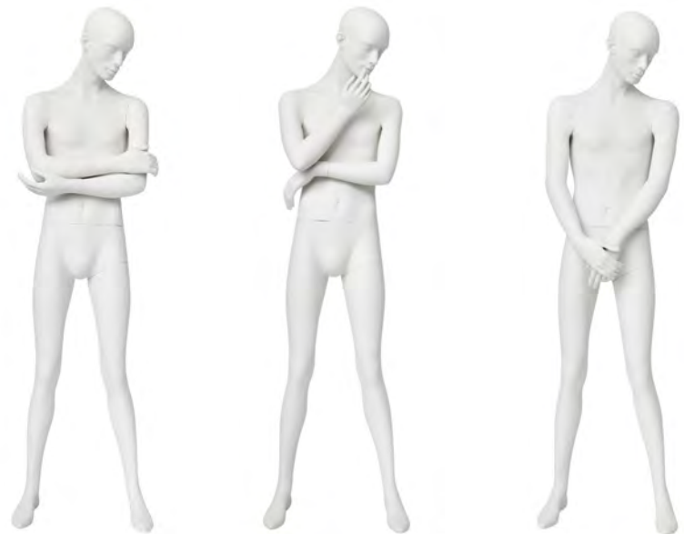
JLSM-07A JLSM-07B JLSM-07C