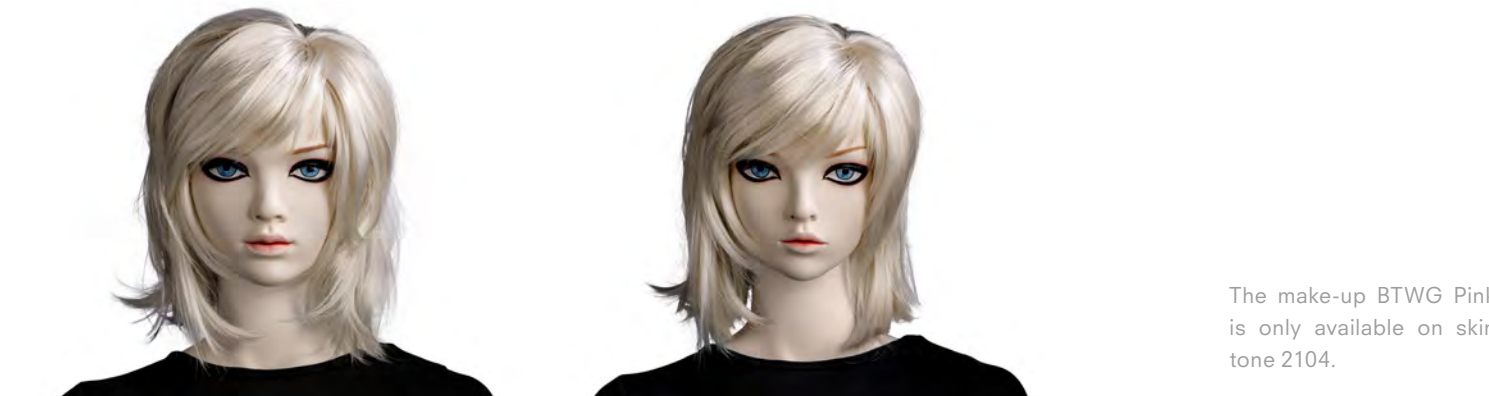
head Marli-117006 Make-up BTWG Pink