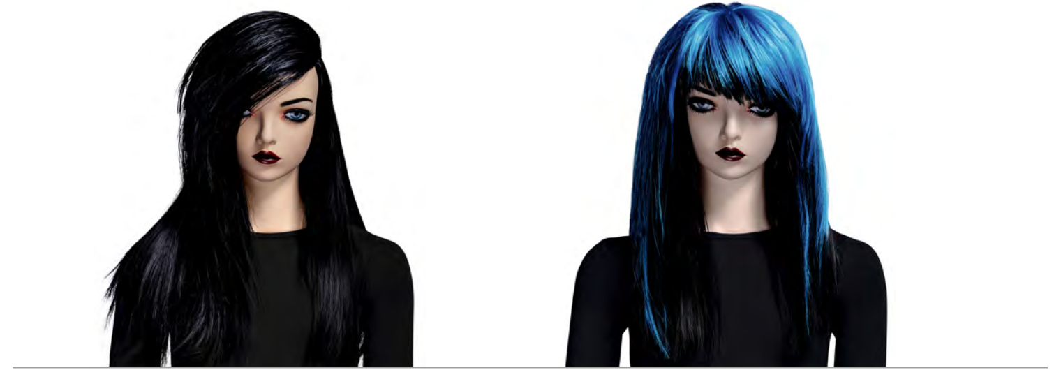
wig BTW-03 Black