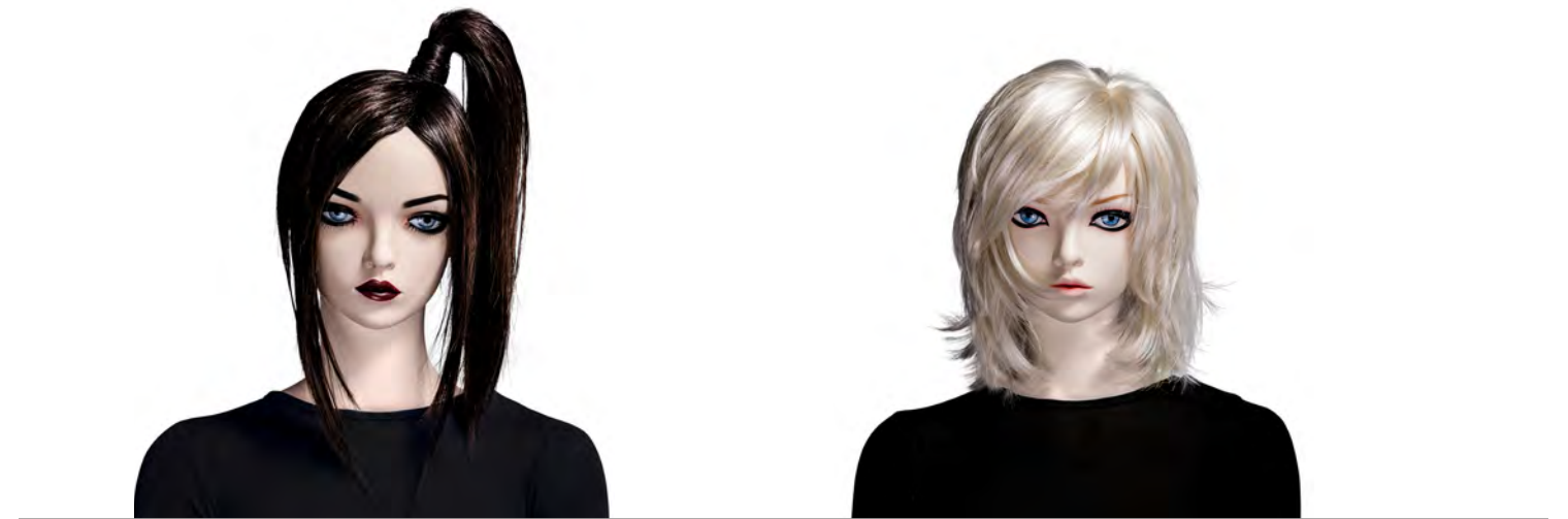
wig BTW-02 Dark brown

The make-up BTWG Dark red is only available on skin tone 2105.