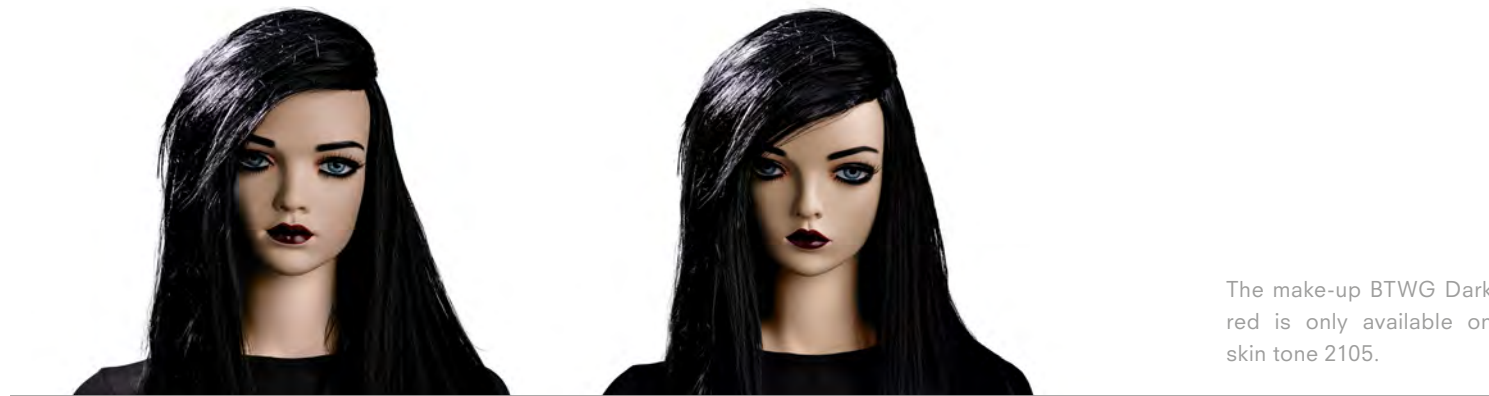
head Marli-117006 Make-up BTWG Dark red