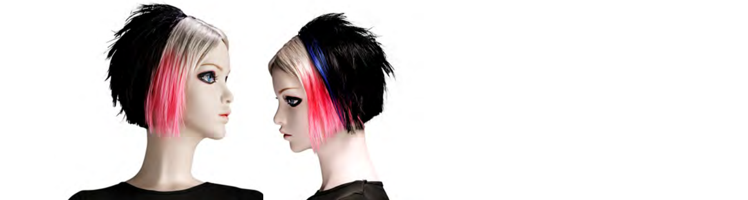
wig BTW-05 Black, silver blond, blue & pink

The make-up BTWG Pink is only available on skin tone 2104.